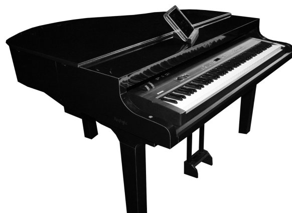
60" Grand with lid down Shown with keyboard