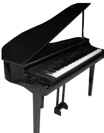
60" Grand with lid up Shown with keyboard